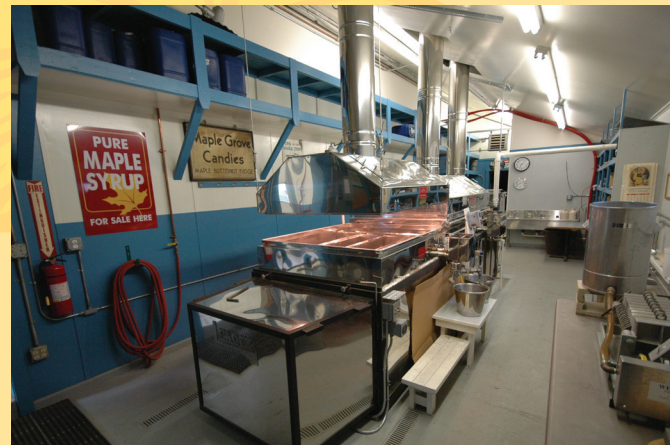
Our maple syrup is produced during the "Sugarin' Season" which only lasts about 10-weeks. Tours of our state-of-the-art production facility are available by appointment, and hours vary during the season.

Our syrup is available locally at these establishments: