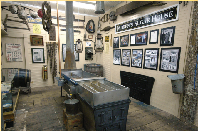
Our Sugar House Museum is open year-round where you can see our collection of traditional equipment and other artifacts, and learn first-hand about the process.

Unopened containers of maple syrup should be stored in a cool, dry place. Once opened, maple syrup should be refrigerated. If, after extended storage, mold should form on the surface of the syrup, the original quality can be restored. Remove the mold, heat the syrup to boiling, skim the surface, rinse the container and refill it with the hot syrup.